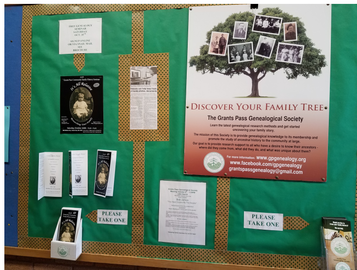
Bulletin Board at the Community Library Grants Pass

Wednesday, October 17, 10:30-12:00 PM Genetic Genealogy Interest Group