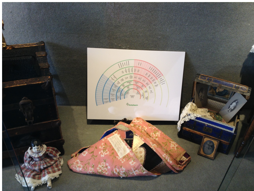
Handmade China Doll, Quilt Made in 1890, member pedigree fan chart, Steamer trunk, photo albums & vintage clothing