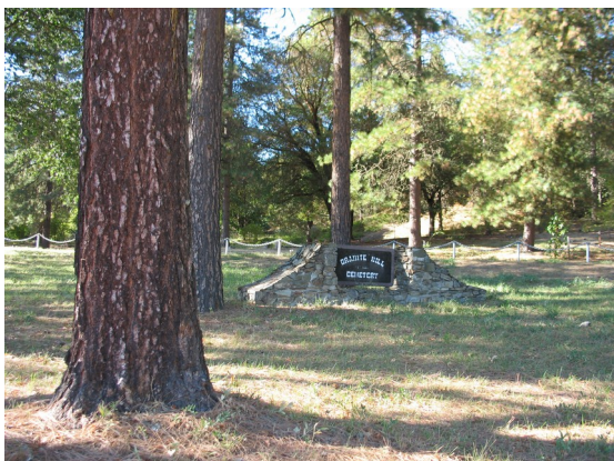
Historic Granite Hill Cemetery